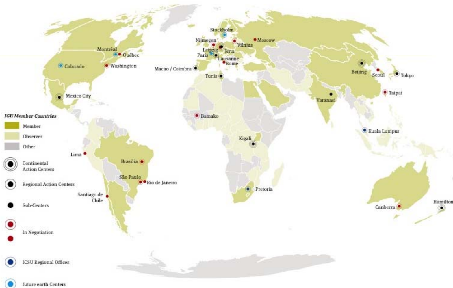
Network of IYGU Regional Action Centers