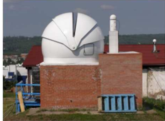
Figure 1: Stations "Mendeleevo 1874" (left) and SLR station "Irkutsk 1891" (right)

The ERP activities at VNIIFTRI can be grouped in four basic topics: